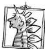
TONY ROSS My Illustrator