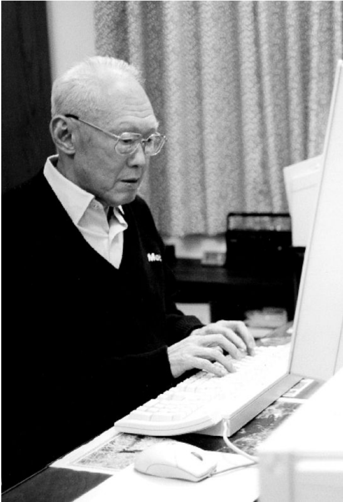
At work on my drafts on home PC (Oxley Road).